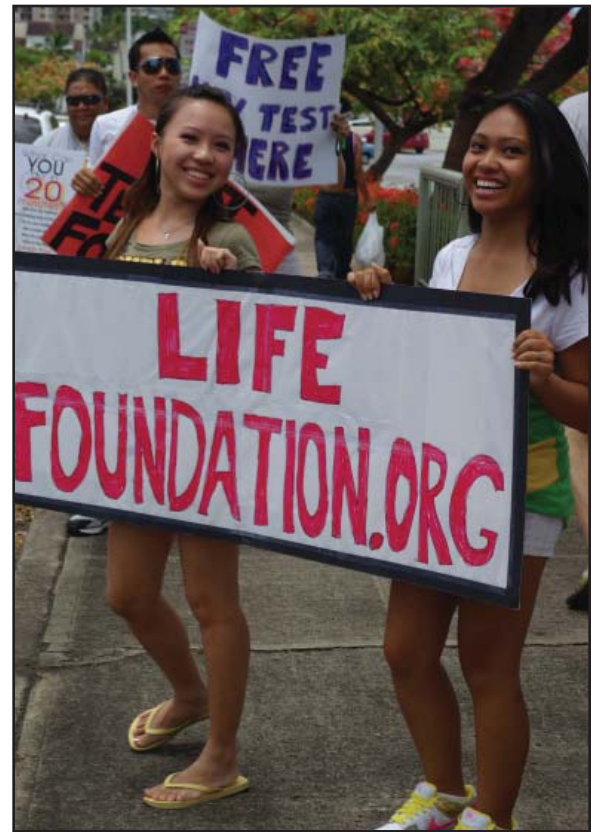
Visit Us! Volunteers at National HIV Testing Day encourage people to visit www.lifefoundation.org .

Thank you for being a part of our organization, and please keep in touch!