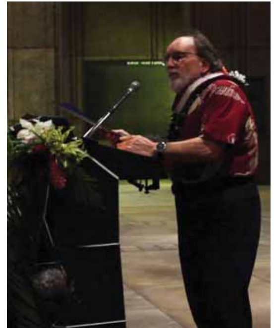
Gov. Abercrombie spoke Dec. 1 during the Honolulu World AIDS Day ceremony at the Hawaii State Capitol.